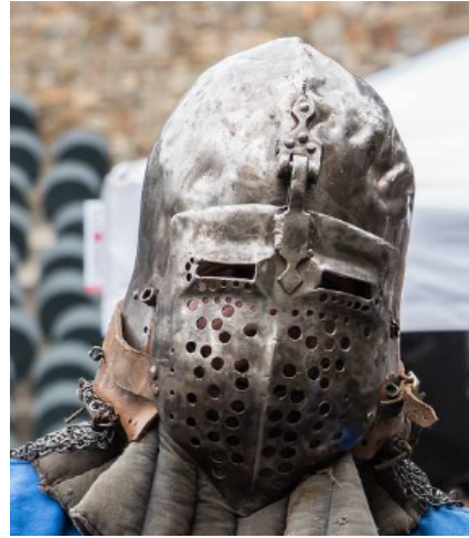
Visor not based on historical sources + incomplete aventail