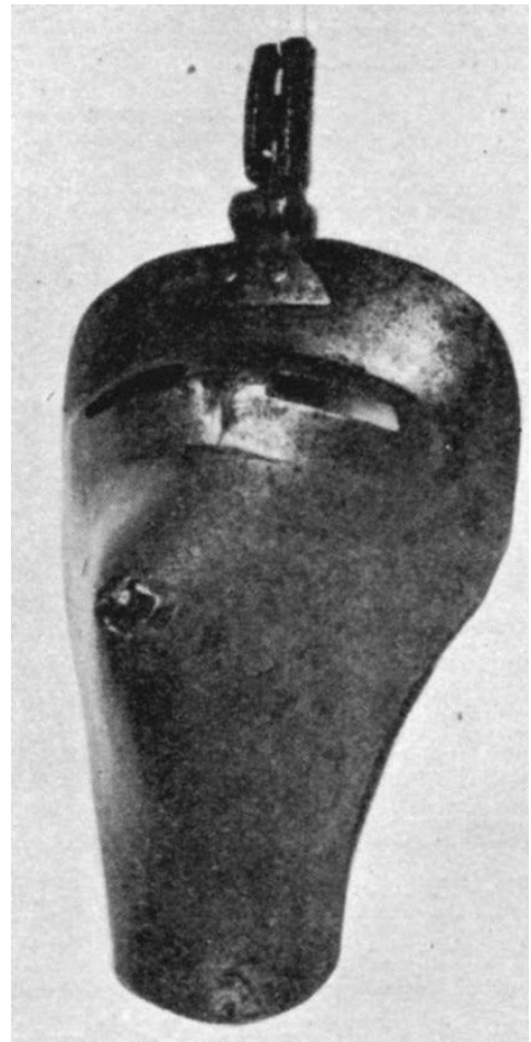
Leeds Armouries - 1350/1380 - England