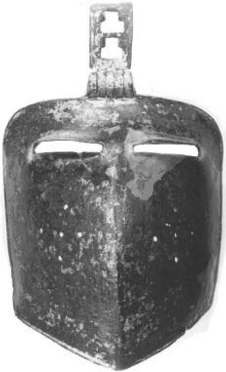
1375 - Netherlands