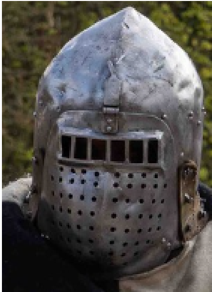
Eye slot out of historical proportions