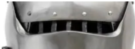
Example from Medieval Extreme ©