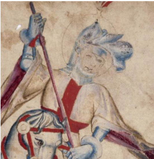
Bodleian Library - 1400/1425 - England