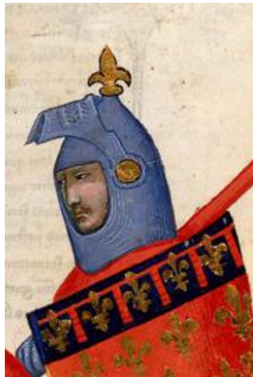
BL Royal 6 E IX Address in verse to Robert of Anjou, King of Naples - 1335/1340 - Italy