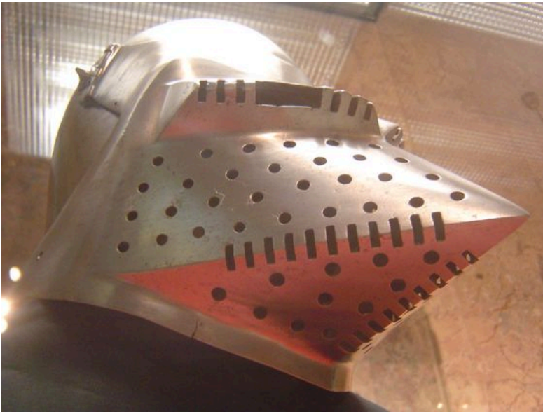
1400-1410 - Kunsthistorisches Museum Wien - Austria

These helmets are very common at this time. Many originals survived and are displayed in museums.