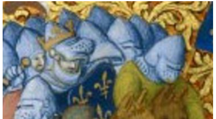
Les Grandes Chroniques de France - 1400/1425 - France