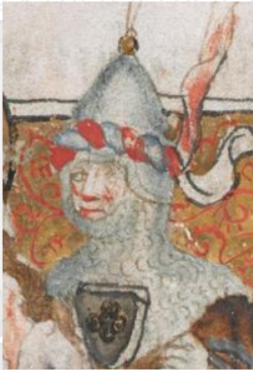
Book of Hours - 1320 - The Netherlands