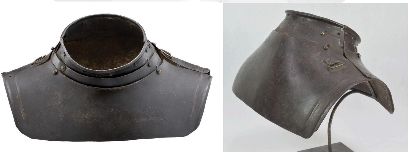
Wade Allen collection - 1510 - Italy